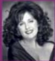
Soprano Gina Galati POWELL HALL DEBUT